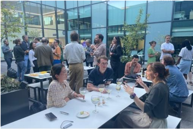
The lovely weather allowed us to enjoy the nearby outside spaces