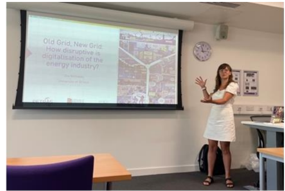
We had a range of formats - from traditional presentations to interactive sessions