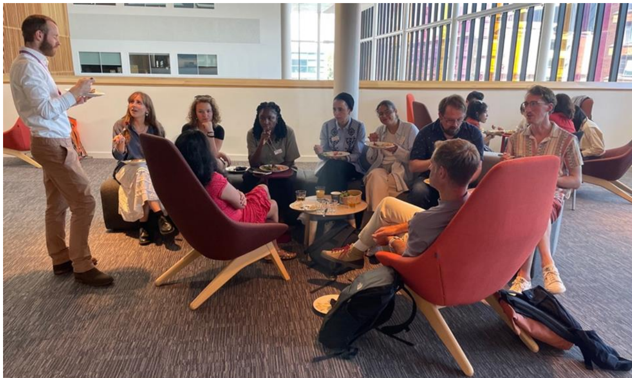
Breaks were a great time to network and meet people informally

A big thank you to everyone who was involved in our Biennial conference, held at the Manchester Alliance Business School on 4th and 5 th of September – invited speakers, the conference organising team, conference helpers and of course those who attended as participating speakers or audience members. The 58 attendees from 24 different organisations – with every major STS centre represented. This year's theme was Dis-Ruption, with various strands and subthemes around disruption emerging, including disruptive and disrupting technologies, disruptions of and with 'nature' and the environment, disruptive methods and processes – in research, music, education, healthcare and society.