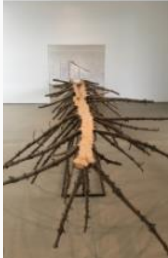
Matrix , George Penone, Yorkshire Sculpture Park